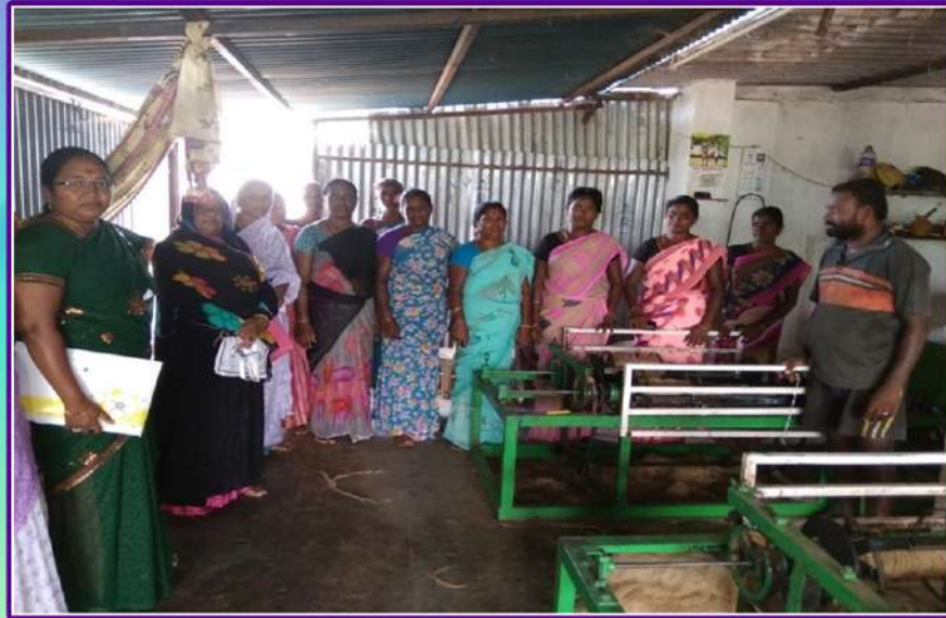
Coir Training for SHG members in coir factory at Manapparai