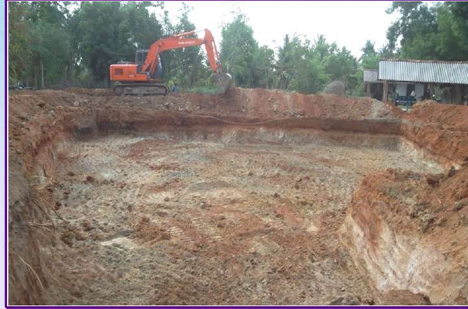
Harvested Rain Water