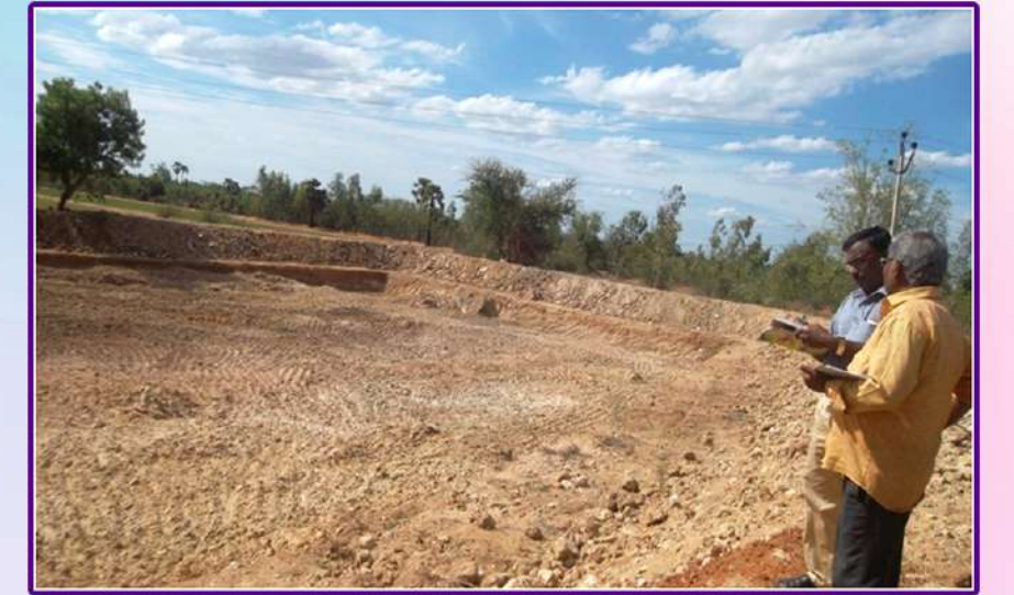
Harvested Rain Water