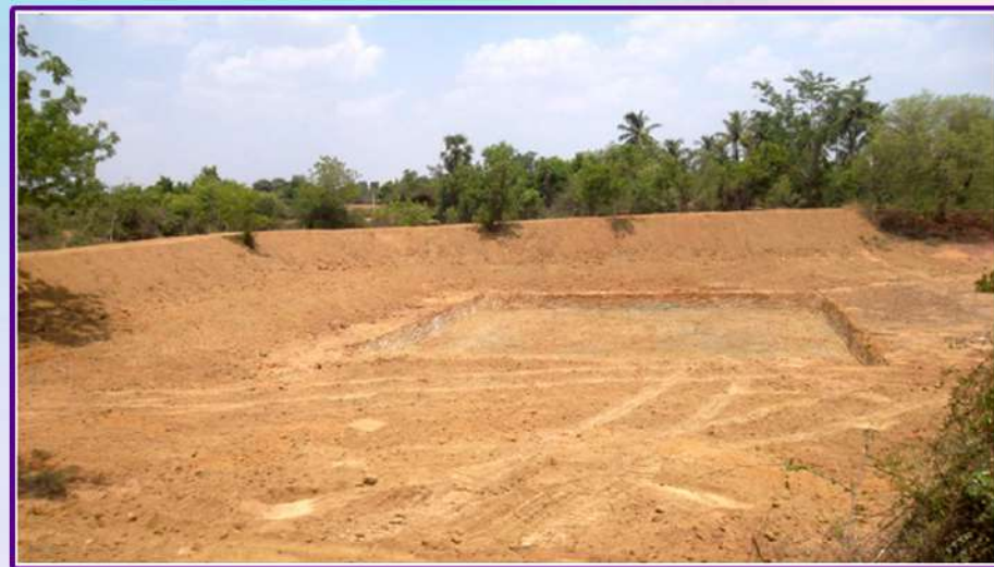
Harvested Rain Water