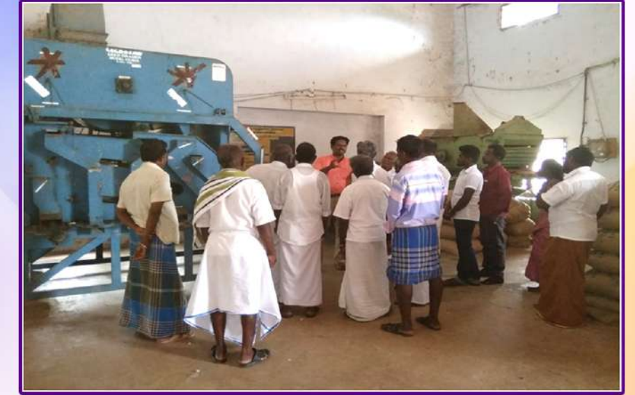
Training at State Agriculture farm & State seed farm for plantation and seed certification