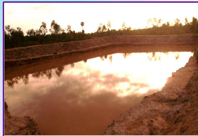
Harvested Rain Water