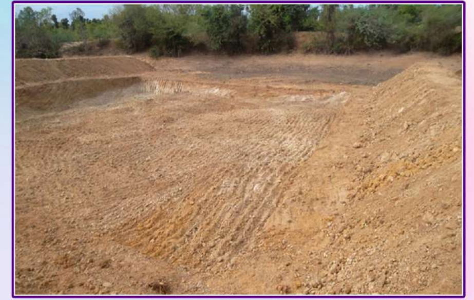
Harvested Rain Water