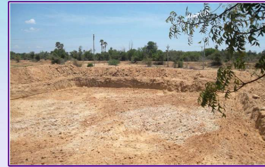
Harvested Rain Water