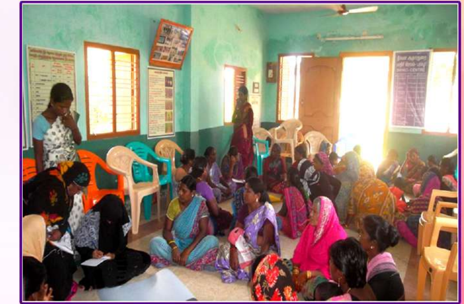
Accounting & Leadership training for SHG members