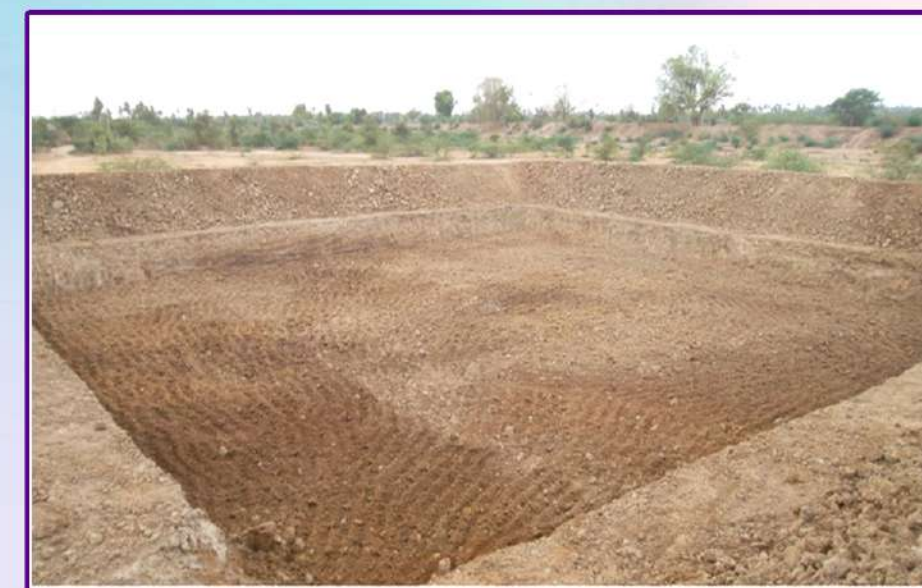
Harvested Rain Water