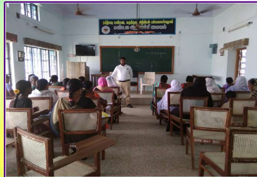
Livestock Management training at Govt. Veterinary University, Pudukkottai