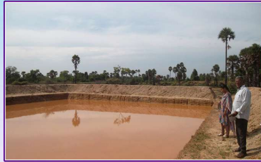
Harvested Rain Water