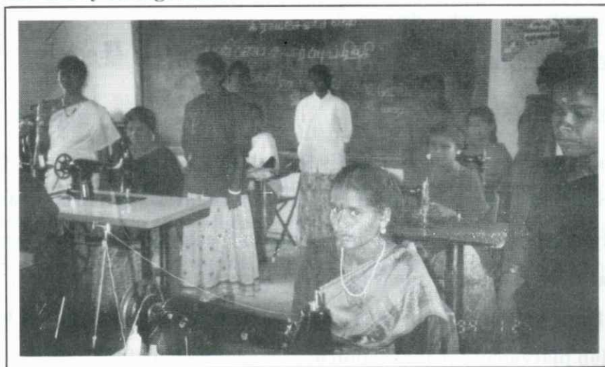
Tailoring and Embroidering Training

In GSS project area, a large number of youth are illiterate and belong to very poor families. They are working in hazardous and low paying occupations such as agricultural labour, gem cutting, quarry work, cattle rearing and domestic work. Prior survey indicate that a majority of the parents desire that their children be imparted with useful skills that would enable them to earn better wages and improved living conditions. Realizing this fact and based on the demand from the parents and the communities, GSS started vocational training programmes. In the carrier guidance workshop many young women/ girls expressed a strong desire to learn Tailoring and Embroidering. The trainees were selected based on their personal and family background.