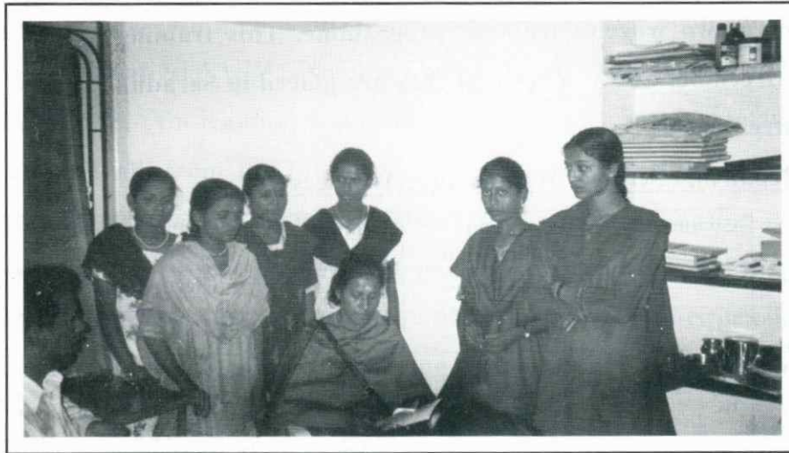
Nursing Assistant Course

Eventhough this course was planned only for five girls, we have given the opportunity for two more girls making a total of seven girls.