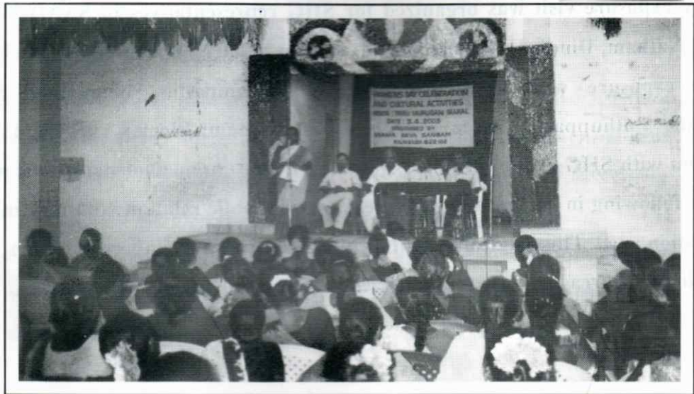
Women 's Day Celebration

The Women's Day celebration and cultural activities were conducted at Panchayat Union Middle School, Kilikkudi on 20 th March 2004. The aim of the celebration was to motivate the women for collective gathering and expose them to various aspects such as literacy and women empowerment, social mobility, legal awareness and